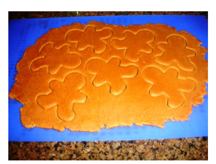
Step 11 - Separate the cut-outs from the trim dough

You can gently peel away the excess dough between the cookies. If you cut them on a baking mat, you can lift the entire mat onto a cookie sheet to put in the oven. Otherwise, you will need to gently lift and move them.